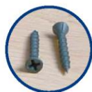
Maxi HP Screws