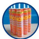
SRS Acoustic Sealant