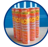
SRS Acoustic Sealant