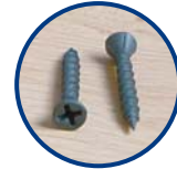
SRS Maxi Screws