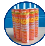
SRS Acoustic Sealant