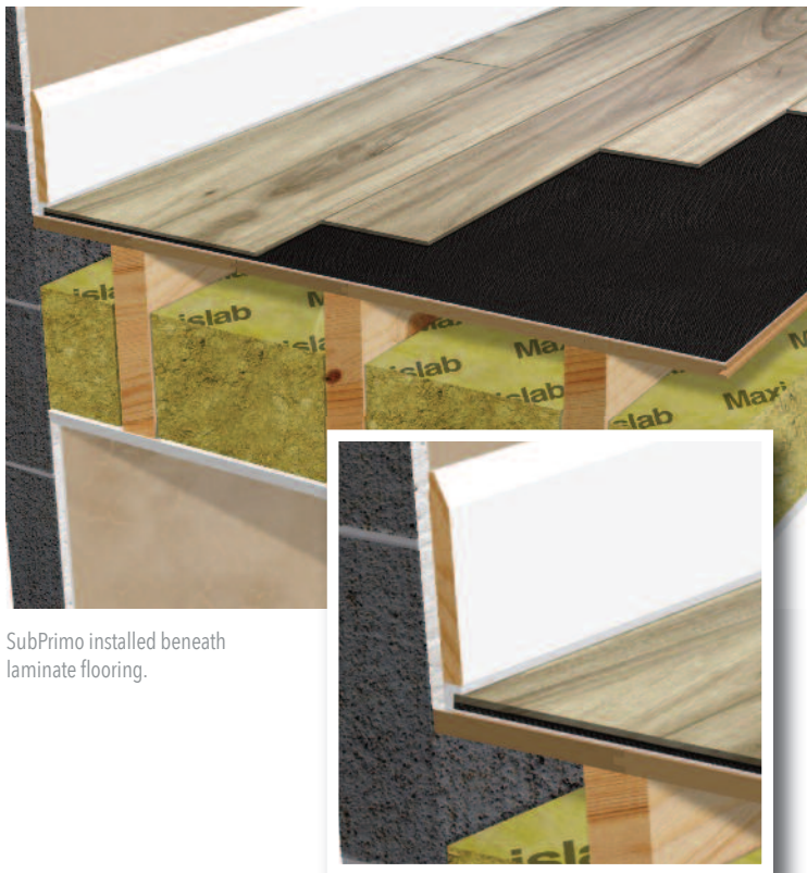
SubPrimo installed beneath laminate flooring.

As with all floating floor installations, no fixings should be allowed to penetrate the resilient layer.