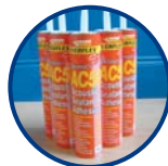
SRS Acoustic Sealant