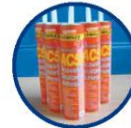
SRS Acoustic Sealant