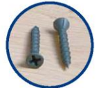
Maxi HP Screws