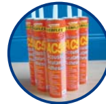
SRS Acoustic Sealant