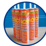
SRS Acoustic Sealant