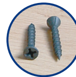
Maxi HP Screws